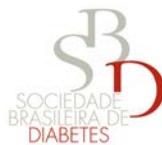
Sociedade Brasileira de Diabetes